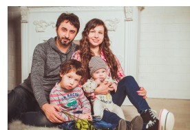
The identity of our clients has been changed to respect their privacy.